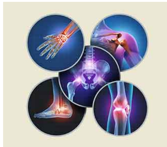
Other Ortho Surgeries